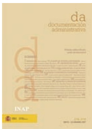
Documentación Administrativa (DA)