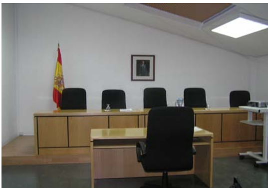
One of our exam rooms

Recruitment into the Civil Service is one of the major tasks of the INAP. Every year, the Institute runs, in a centralised way, several fair and open competitions for different grades and ranks of the State Civil Service, from clerical staff to managers. This is made through the Permanent Selection Committee ( Comisión permanente de selección ), or through specific recruitment boards (for the upper ranks of the Civil Service). In 2010, in accordance with the annual national announcement of civil service vacancies, the Institute managed eleven recruitment processes with an overall figure of more than 13,000 candidates, for a total of 395 vacancies.