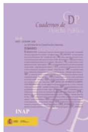
Cuadernos de Derecho Público (CDP)

Furthermore, the research activity of the Institute is carried out by establishing "Groups of Experts", awarding research prizes and fellowships (namely the INAP-Fulbright program), and through the organization of conferences and seminars.