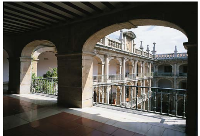
Our facilities in Alcalá de Henares