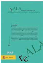
Revista de Estudios de la Administración Local y Autónoma (REALA)

In addition, the Institute currently publishes four periodicals, with a legal and public management perspective on government, public administration and public policies: