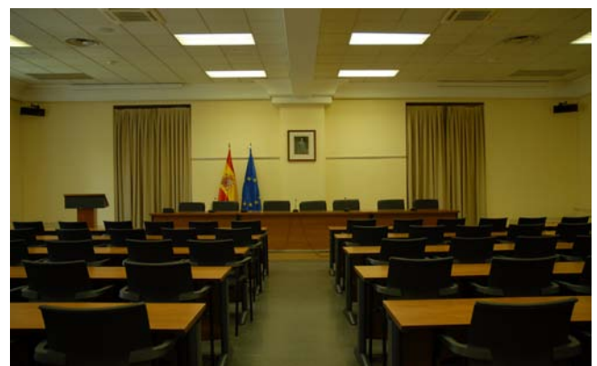
Our main conference hall

The INAP endeavours to improve permanently its quality training standards and holds cooperation with other prestigious international schools and institutes, such as the French ENA, the National School of Government (UK) and the EIPA. During the year 2010, the Institute provided roughly 52,000 training hours, which were addressed to almost 25,000 public employees from all levels of governments, as well as to international civil servants.