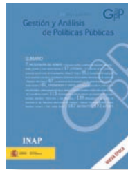
Gestión y Análisis de Políticas Públicas (GAPP)