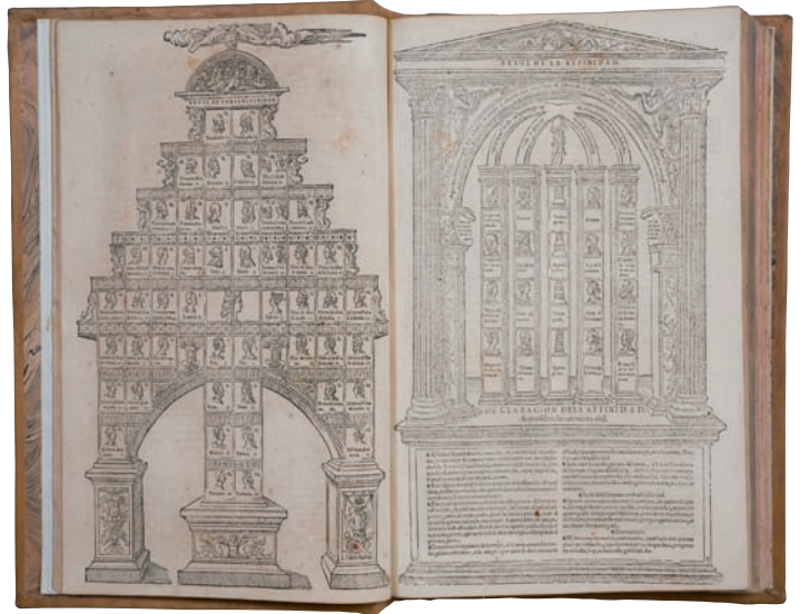
One of our oldest books from the XVIth century, Las Siete Partidas , by the King Alfonso X

The Institute is provided with a magnificent library, specialised in Public Administration, Government and Public Law, with more than 230,000 volumes and some 1,500 periodicals. The library also holds an Antique Books Collection, which comprises more than 9,000 volumes written between the XVIth and the XIXth centuries.