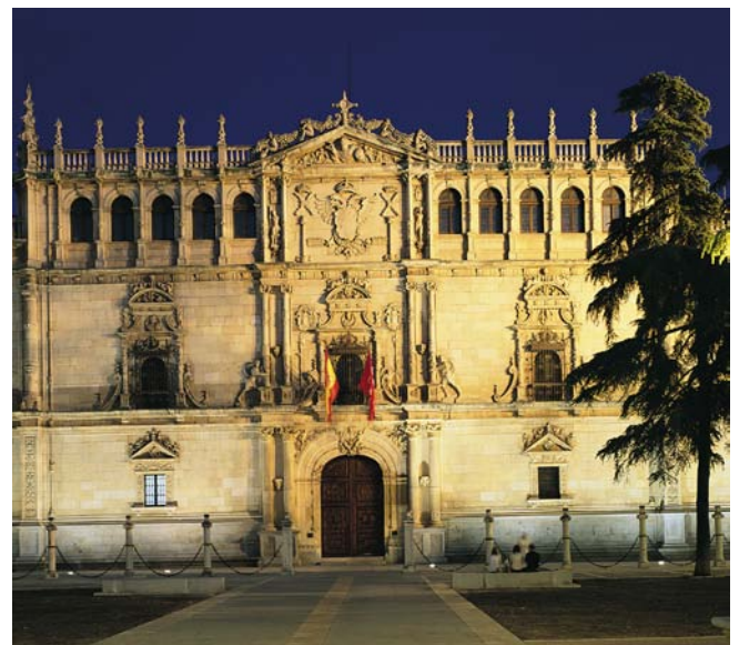
Alcalá office: San Diego sq. 28801 - Alcalá de Henares (Madrid, Spain)