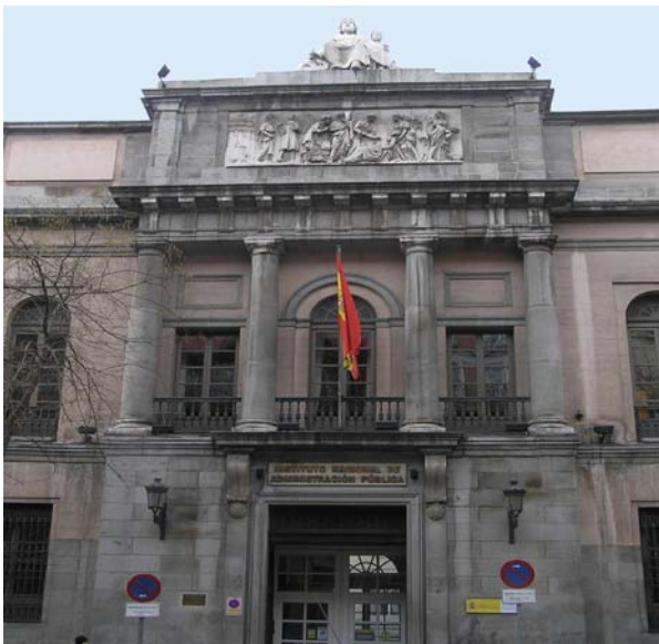
Main office: 106, Atocha St. 28012 - Madrid (Spain)

The National Institute of Public Administration (in Spanish: "Instituto Nacional de Administración Pública - INAP") is an autonomous body within the national government of Spain, attached to the Department of Territorial Policy and Public Administration. It has a long-standing tradition of more than seventy years of work in the public service, as its origins date back to 1940